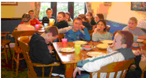
Are you being served?