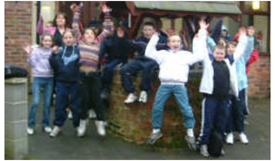
Jumping for JOY

G-Force say a A BIG THANK YOU to BCA for Supporting this Event.