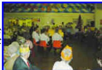
This years party